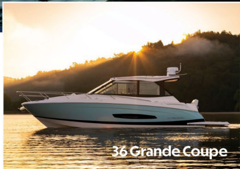
36 Grande Coupe